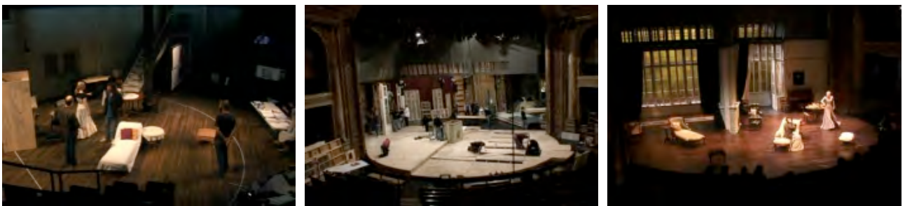
Rehearsal, Construction, Performance

The day after closing night the set is dismantled from inside the theatre in what is called 'bump out.' Due to storage space restrictions sets are unable to be kept. STC's commitment to sustainability through the 'Greening the Wharf' initiative means that the wood from sets is recycled or reused in the creation of new sets or samples. Props and costumes are often given a second life and used during rehearsal periods. Theatre is an impermanent art form, so the reuse of production elements is a small way for a play to live on and have another life.