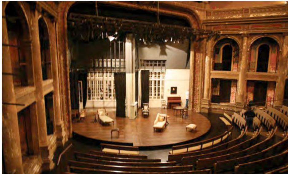
The Hedda Gabler set in place at the Harvey Theatre, BAM