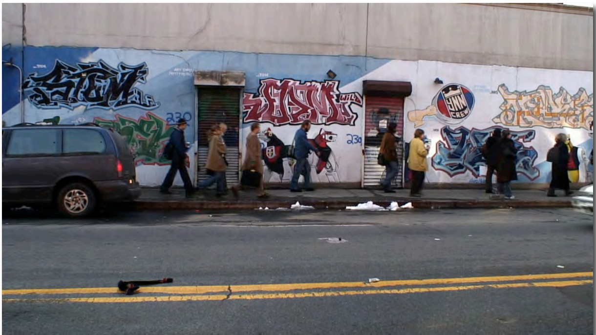
Cast of Hedda Gabler in Brooklyn