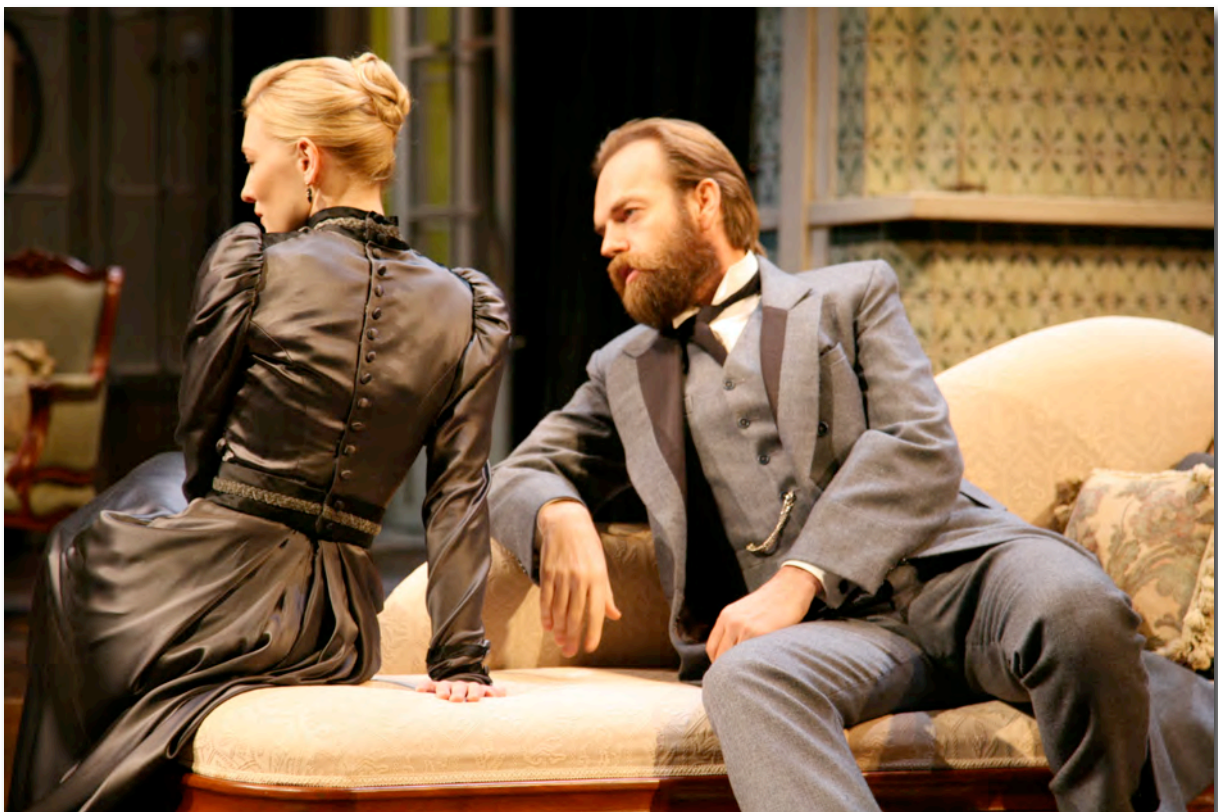
Cate Blanchett (Hedda) and Hugo Weaving (Judge Brack) in Hedda Gabler

At the end of the play Hedda's resistance to her role as wife and mother in society, her absence of purpose, fear of scandal and Brack's control over her create the perfect crucible for her suicide – her freedom.