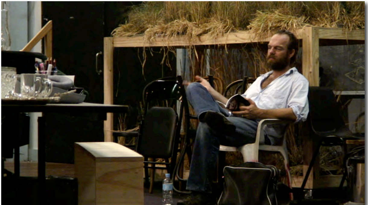
Hugo Weaving in rehearsal for Hedda Gabler